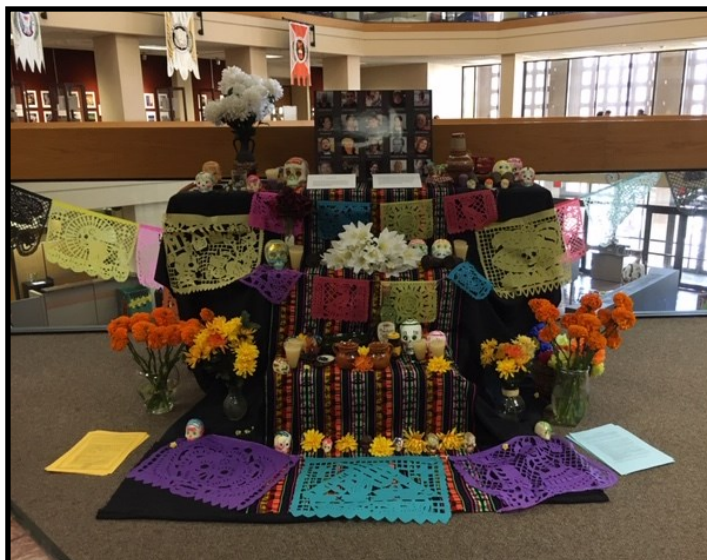
Día de los Muertos altar, 2019.