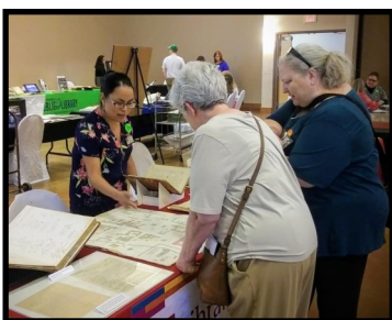
Border Archives Bazaar, September 28.

Over 275 people attended the third Border Archives Bazaar on September 28 at the New Mexico Farm and Ranch Heritage Museum in Las Cruces.