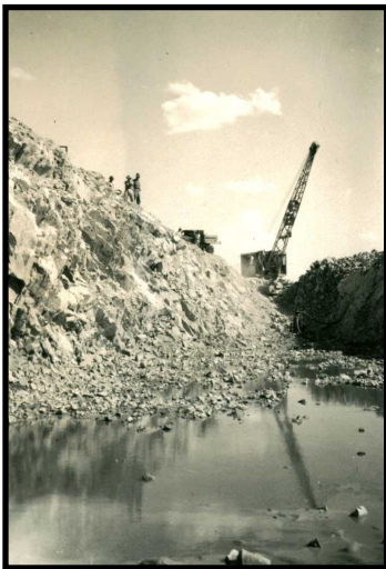
Building the American Dam photograph album, PH090.

Based on enthusiastic feedback, BRAG plans to hold another similar workshop sometime in 2020. Attendees also requested workshops about digital records and more in-depth preservation topics.