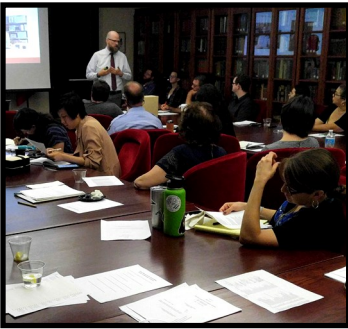
Archives 101 workshop, June 27.

The Border Regional Archives Group (BRAG) held its first professional development workshop, “Archives 101,” on June 27 in UTEP Special Collections. Over 30 people attended the all-day workshop, which was geared toward archivists, curators, and librarians who manage collections, but lack formal training in archives and preservation.