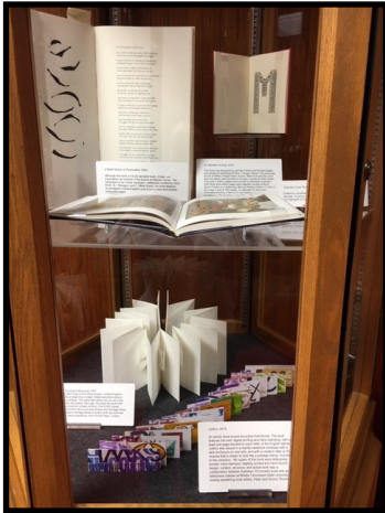
ABCs in the Archives exhibit, January 2020.