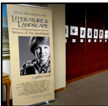
Literature and Landscape exhibit, February 2020.

And on the Portal to Texas History there are 3,434 items from Special Collections, including city directories, newspapers, and Mexican Revolution primary sources.