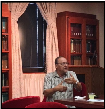
Playwright Carlos Morton in Special Collections, April 5.

On April 5 Special Collections hosted a well-attended panel discussion about Carlos Morton's play The Many Deaths of Danny Rosales . The play was based on a real-life police brutality case in Central Texas during the late 1970s.