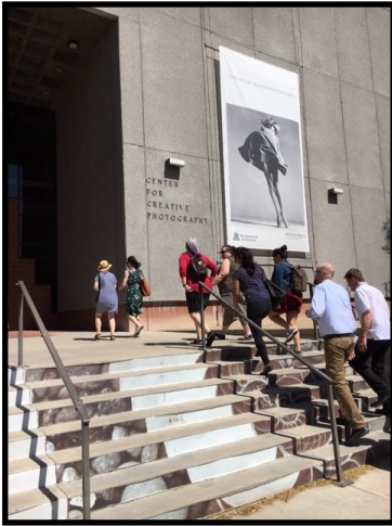
Touring the Center for Creative Photography in Tucson.