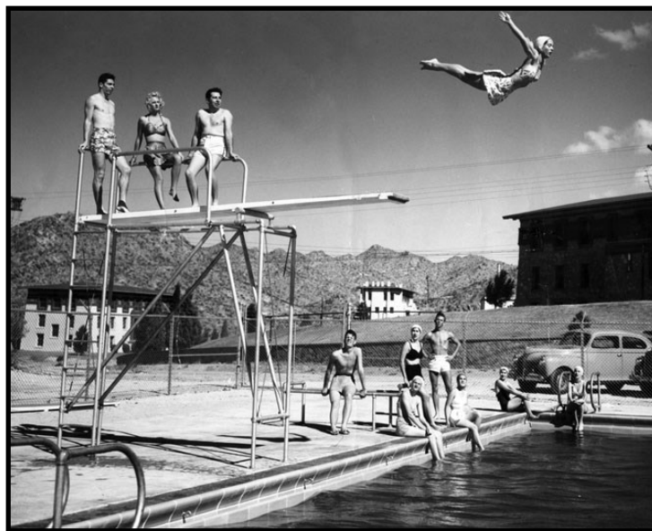
Old UTEP swimming pool, circa late 1940s

The Library sits on a hill within sight of the Mexican border. Our unique position informs our attitudes and the services we offer. We aim for excellence in serving our users and in making our collections accessible.