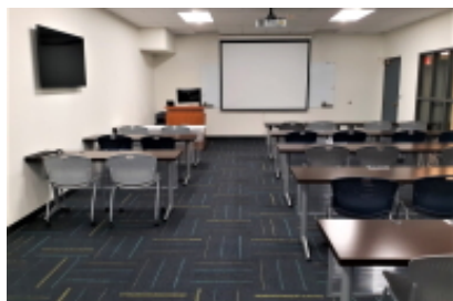
The new Data Analytics computer lab ...

(Editor's note: this story was compiled from pieces in the UTEP Prospector , El Paso Herald-Post , El Paso Inc. , and El Paso Times )