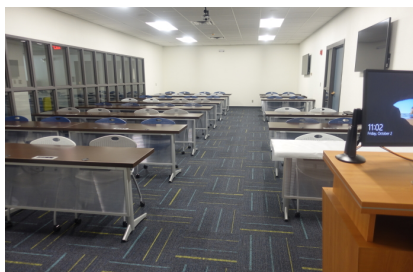
... will support the new Ph.D. program