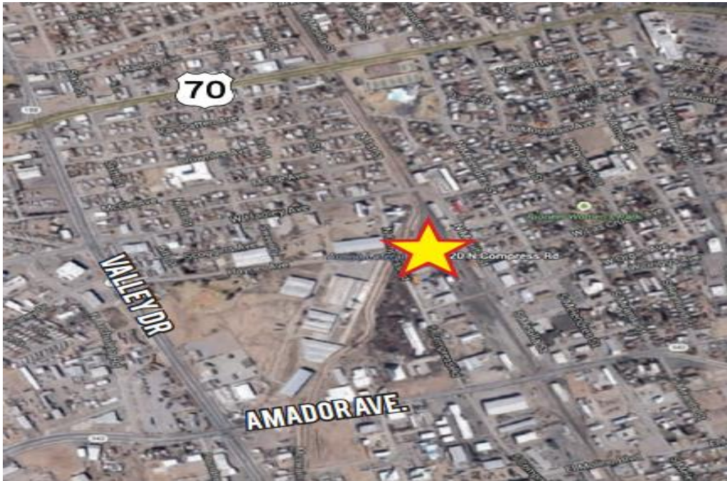
Retrieved in June 2016.