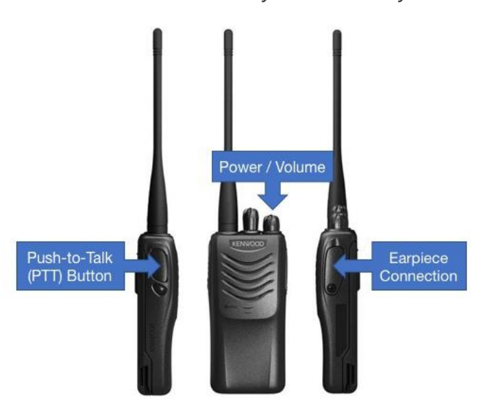
Figure 3.1: Basic features of two-way radios used by Union Services

Our staff use two-way radios to communicate with each other while working throughout our facilities. Radios are the property of Union Services and are not to be removed from the workplace under any circumstances. Each employee is responsible for keeping the radio in his or her possession and turned on at all times while working, and for returning the radio to its charger or handing it off to another employee at the end of work. Certain situations may require the use of an earpiece for privacy; this will be provided by your supervisor as needed. Radio range is limited and may not be sufficient for remote locations such as the EPNG Conference Center.