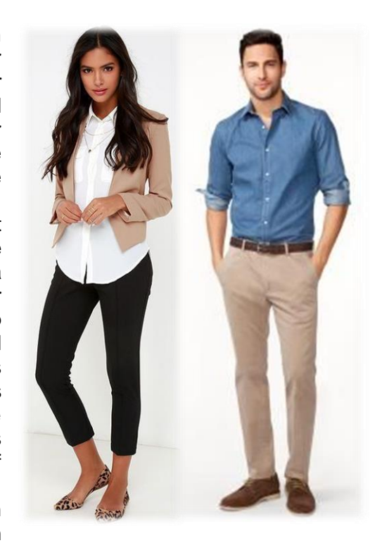
Figure 5.1: Examples of business casual attire for men and women

The dress code for all student employees of Union Services is business casual. Clothing should never reveal your back, chest, feet, stomach, underwear, or excessive cleavage. Torn, dirty, wrinkled or damaged clothing is unacceptable. Wording, images, or other graphics that may be considered offensive are prohibited. Unless otherwise directed, jeans may only be worn on Fridays and must be free of rips and holes. Dress and skirt length should permit you to sit comfortably in public. Shoes must be closed-toe and free from stains and major damage. Hair should be of a natural color and not messy; facial hair is permissible for men but must be neatly groomed. Jewelry and makeup should be conservative and in good taste with limited visible body piercings or tattoos. Colognes and perfumes should be used sparingly, if at all. Hats and sunglasses may be worn while working outside but are otherwise prohibited in the workplace unless dictated by religious or cultural tradition or a medical condition. Examples of other inappropriate items include, but are not limited to: Sweatpants, active wear, shorts, leggings (unless worn under a skirt or dress), overalls, mini-skirts, skorts, sun dresses, spaghetti straps, tank tops, midriff tops, halter tops, sweatshirts, t-shirts (except as an undergarment), flashy athletic shoes, sandals, and slippers.