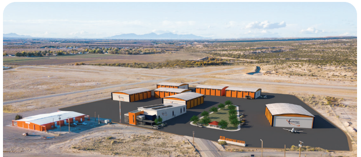
Tech1 Campus-Alpha Site Fabens, TX