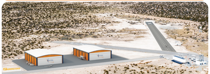
Tech1 Campus-Bravo Site Tornillo, TX