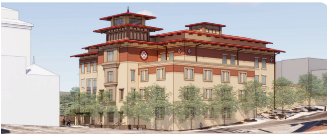
Advanced Manufacturing and Aerospace Center Opens 2024