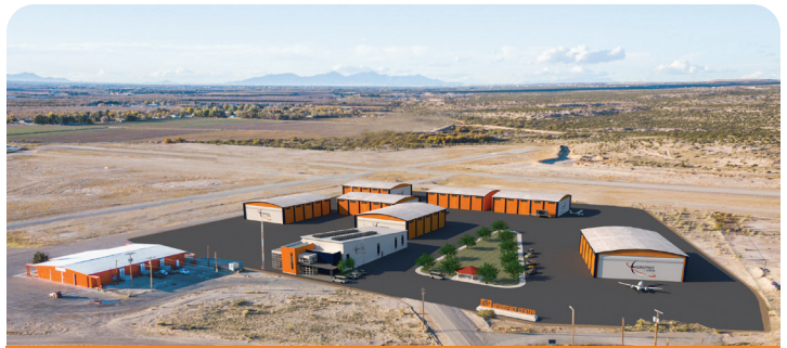
Tech1 Campus-Alpha Site Fabens, TX