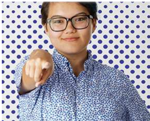
No Name-Calling Week