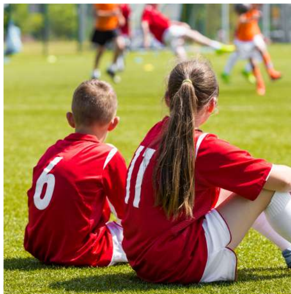
Changing the Game