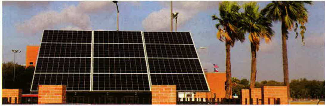
Texas Manufacturing Assistance Center at The University of Texas-Pan American

The center has developed many successful partnerships and participated in improvement projects with hundreds of manufacturers of both durable and non-durable goods in the past 20-plus years. Some of the TMAC partners include companies in the printing, plastics, metal fabrication, electronics, transportation, food and beverage, textile and medical device manufacturing industries.