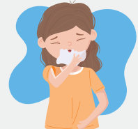
Use tissue when cough/sneeze