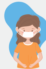
Wear a face mask if you are sick