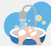
Wash your hands often

If you're feeling unwell with symptoms like a sore throat, fever, or cough, please take care of yourself, stay home and contact your doctor. Remember, your health is a priority. Do your part to keep yourself and your UTEP Miner family safe and healthy.