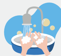
Wash your hands often

If you're feeling unwell with symptoms like a sore throat, fever, or cough, please take care of yourself, stay home and contact your doctor. Remember, your health is a priority. Do your part to keep yourself and your UTEP Miner family safe and healthy.