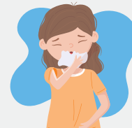
Use tissue when cough/sneeze