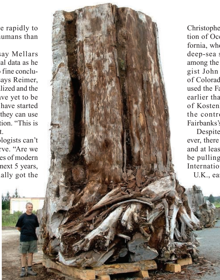
Tall order. Researchers hope ancient kauri trees buried in New Zealand swamps may extend tree-ring records back to at least 50,000 years ago.