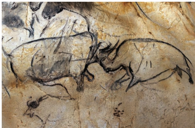
Push 'em back. These fighting rhinos in France's Grotte Chauvet could be more than 4000 years older than originally thought.

Indeed, as radiocarbon experts revise their estimates, all researchers working in the eventful period from about 50,000 to 25,000