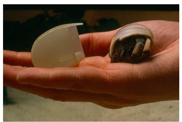
Figure 2, The Hand Up Project, attempting to meet the new needs of natural life forms

My earliest project that grappled with the idea of "trans-species giving" was The Hand Up Project, attempting to meet the new needs of natural life forms (figure 2).