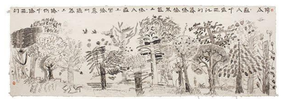
Fig. 2) Forest Project 3, 2009, ink on paper, 116.5 \times 344 cm.