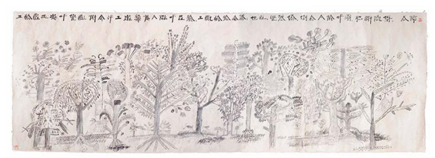
Fig. 1) Forest Project 1, 2008-9, ink on paper, 146.5 \times 341 cm.

The funds that the auction collected were used to purchase seedlings for forestation in those regions. Before these drawings were on sale, Xu would manually copy and juxtapose each of them into large-scale assemblage. The end products were several copies of the children's drawings by Xu himself (fig. 1-3).