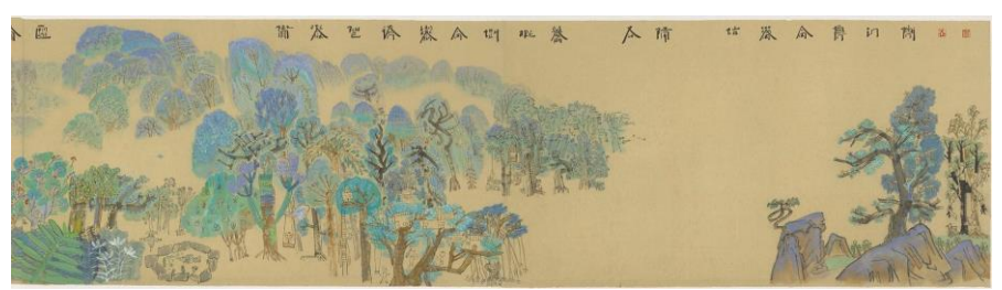
Fig. 3b) Forest Landscape: The Blue and Green World (section 2). Courtesy of Xu Bing Studio

At first glance, the eco-oriented Forest Project seems distinct from Xu's other works that famously explore the natures, compositions, and communicative functions of languages. Its philanthropic goal also makes it seem motivated more by charity than artistic creation. My essay, however, places the Forest Project back into the context of contemporary Chinese art and Xu's oeuvre and writings. The Forest Project, I would argue, reflects Xu's conception of the purpose of contemporary art in relation to political ecology and the tradition of Chinese visual culture, especially through his act of copying which is by no means realistic imitation but his reflection on the traditional Chinese aesthetics of linno : the bettering of one's own artistic development through apprehending the forms of others. In copying, Xu reinterprets and transforms the children's drawings into his own artistic visions and social critiques. The Forest Project thus does not merely illustrate certain political agenda of conservatory ecology but demonstrates how ecology can be carried out in the very act and process of artistic creation.