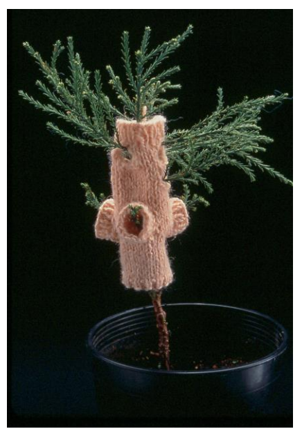
Figure 1, Giant Sequoia

the commonalities between humans and other life forms are such that we humans may be able to give other creatures a "hand up," however misguided or conceptually hamstrung we may be by our beliefs about the natural world.