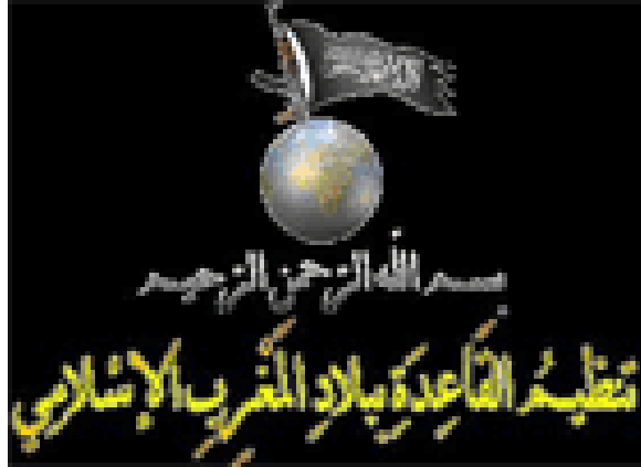
Figure 4: al Qaeda in the Islamic Maghreb (AQIM). 72

In figure 4 the color black again, use of the globe with the focus on Africa to represent the Maghreb. It also contains an AK-47 with a black banner on it.