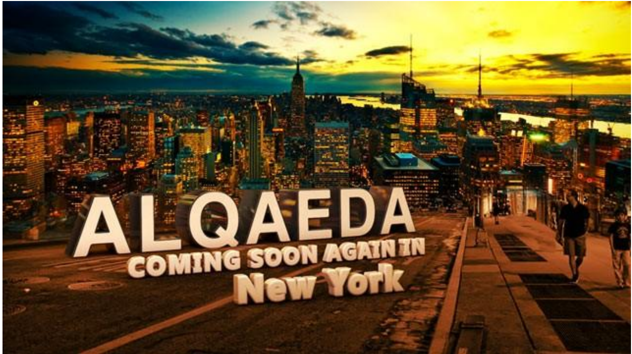
Figure 1: Al Qaeda coming soon again in New York 35

propaganda that al Qaeda supporters used to target New York City.