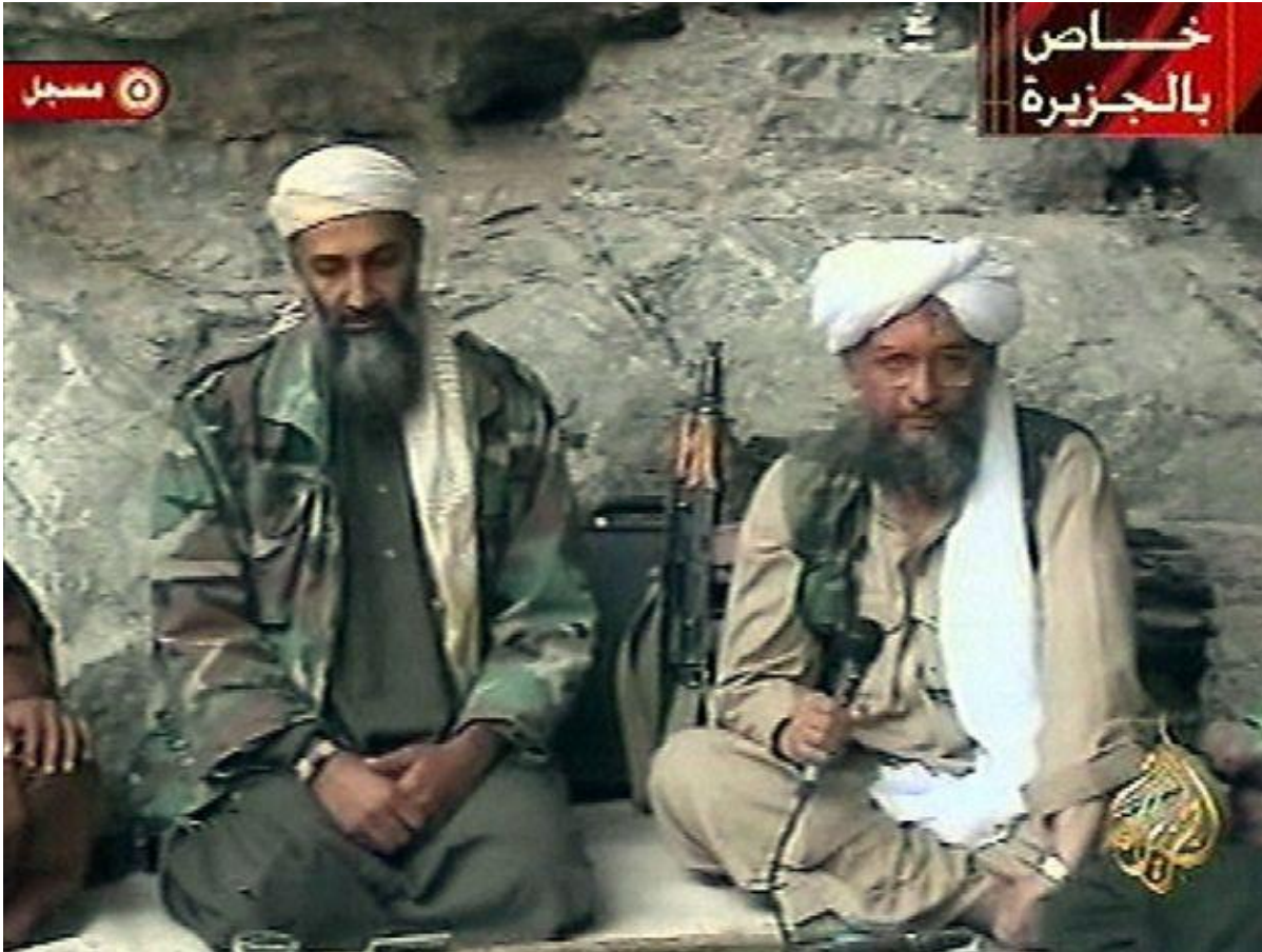
Figure 5: Osama bin Laden and al Zawahri Appearance 73

In figure 5, there are a number of symbols that need to be discussed. Some examples of symbols found in this figure include the AK-47, the colors (white and black), the natural background, and the military fatigues. All have specific meanings that are designed to show both bin Laden and al-Zawahri in a positive light. The weapon and fatigues are used to symbolize jihad and the mujahedeen, the white is used to symbolize purity and piety, and the black as mentioned before is the color of jihad. Another symbol that should be considered is the cave acting as a natural background. This could be interpreted as both bin Laden and al-Zawahri are in the “trenches” (so to speak) and are fighting for the cause at the front lines. A parallel to this is