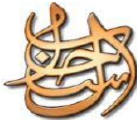
Figure 6: As-Sahab logo 74

when leaders of nations wear specific attire to project a message. An American example was when President Bush wore a flight suit in the Persian Gulf, which helped portray his role as commander in chief. Another example comes from Vladimir Putin who was photographed bare chested riding a horse; the image desired to show his strength and power. Referring to figure 6 the symbol represents al Qaeda's media arm, as-Sahab (which can be seen in the bottom right corner of figure 5). While it is simply a couple of words written in calligraphy, it too, has its historical meaning. Calligraphy has a long and traditional standing in Islamic culture and in its own right is a form of artwork. Pictured below is an enlarged figure of the symbol.