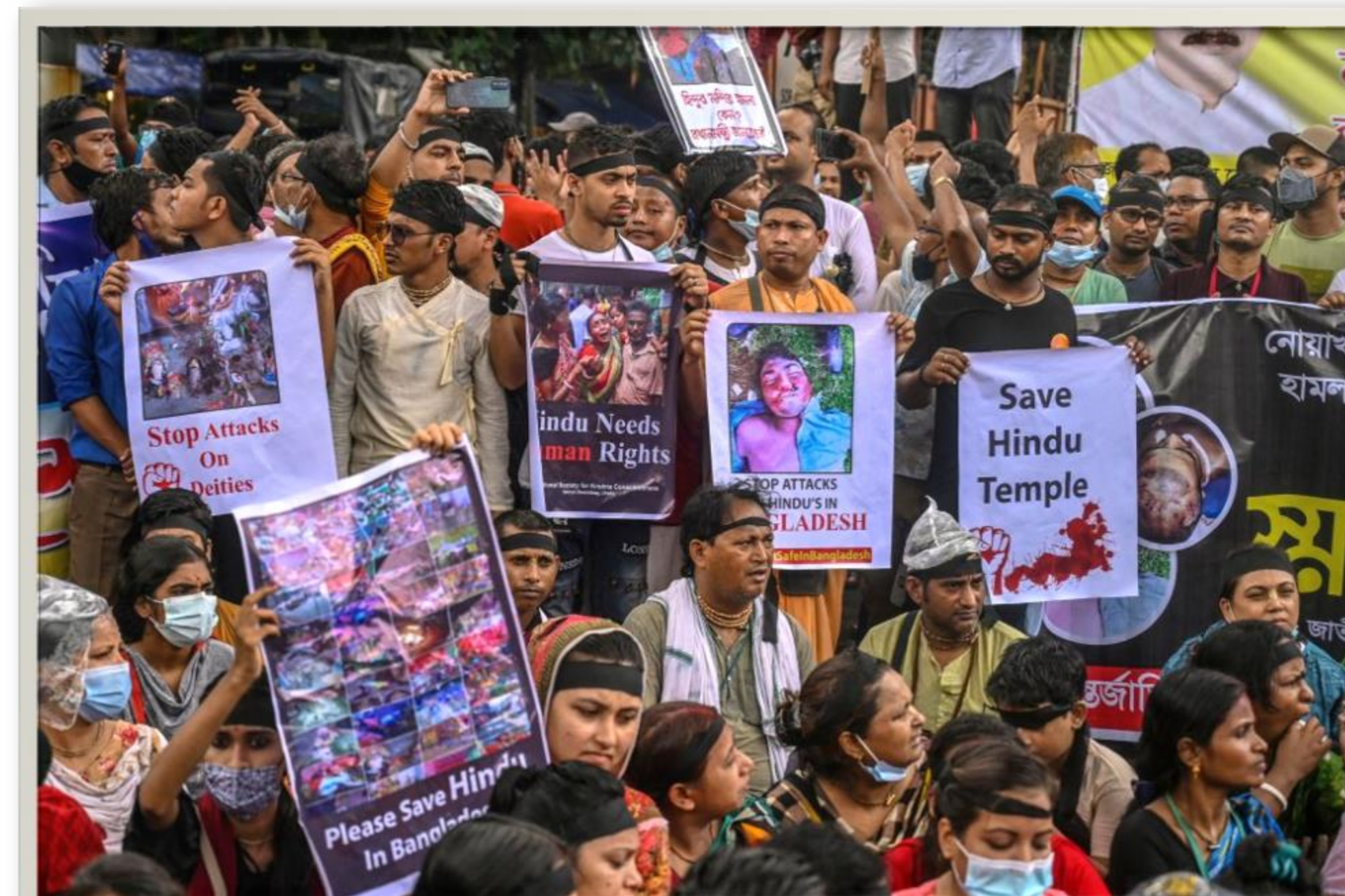
Hindu minority community protest calling for safety and rights. (Dhaka, Aug. 9, 2024).