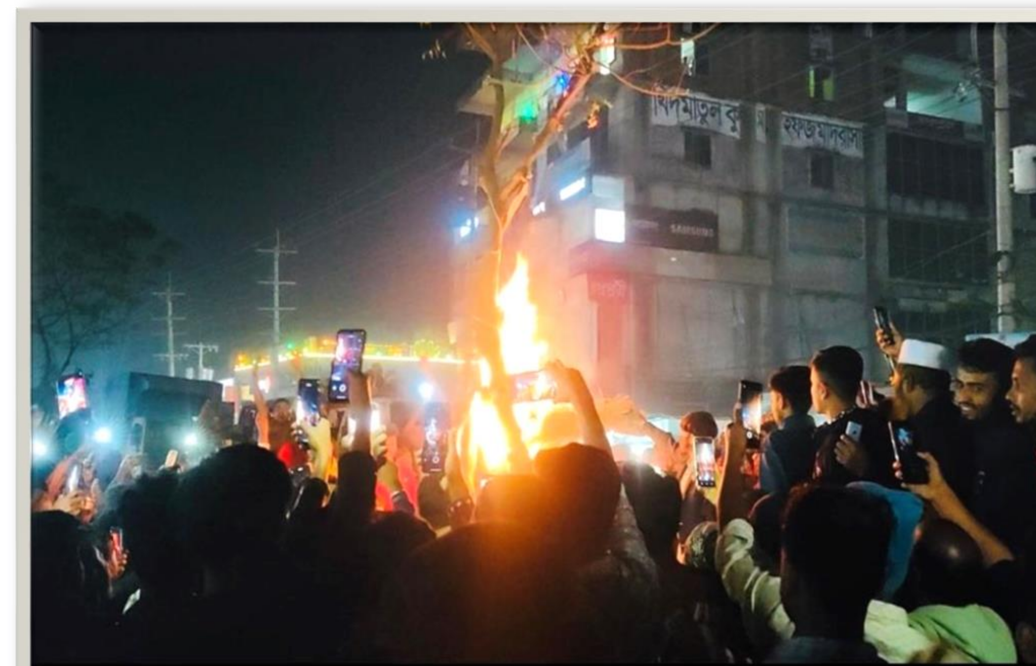
Mob violence linked to social media rumor/hate