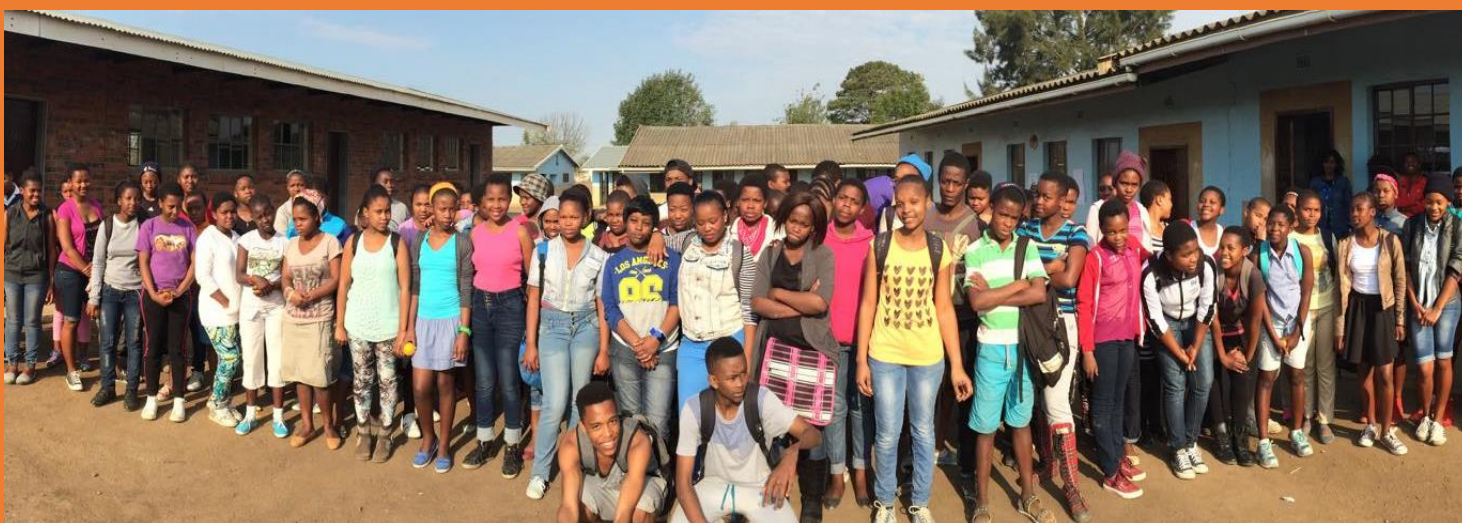
Pictured: residential participants at Imbeleko Foundation; MARC's partner in South Africa