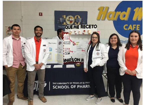
poster at the SUNS fair

On April 17 th , our students were at the HOPE fair at the Opportunity center for the homeless providing elements of MTM, encouraging smoking cessation, blood pressure assessments, and many other activities.