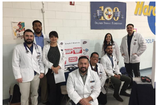
Figure 2 P1 and P2 IPPE students at the Blood Pressure table at the SUNS fair