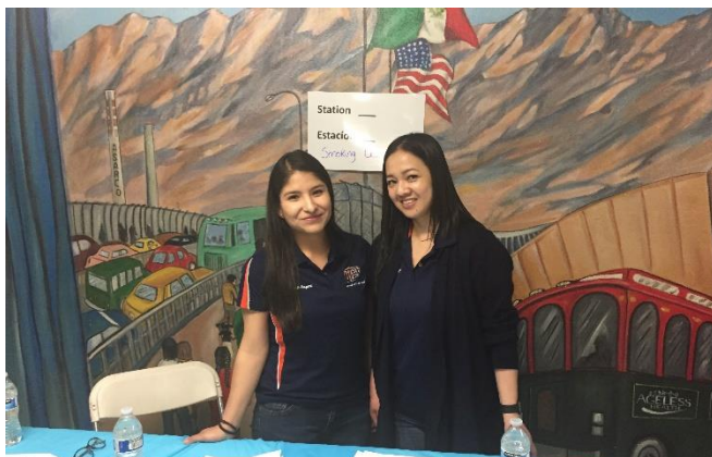
Figure 3 P1 IPPE students at the HOPE fair encouraging smoking cessation